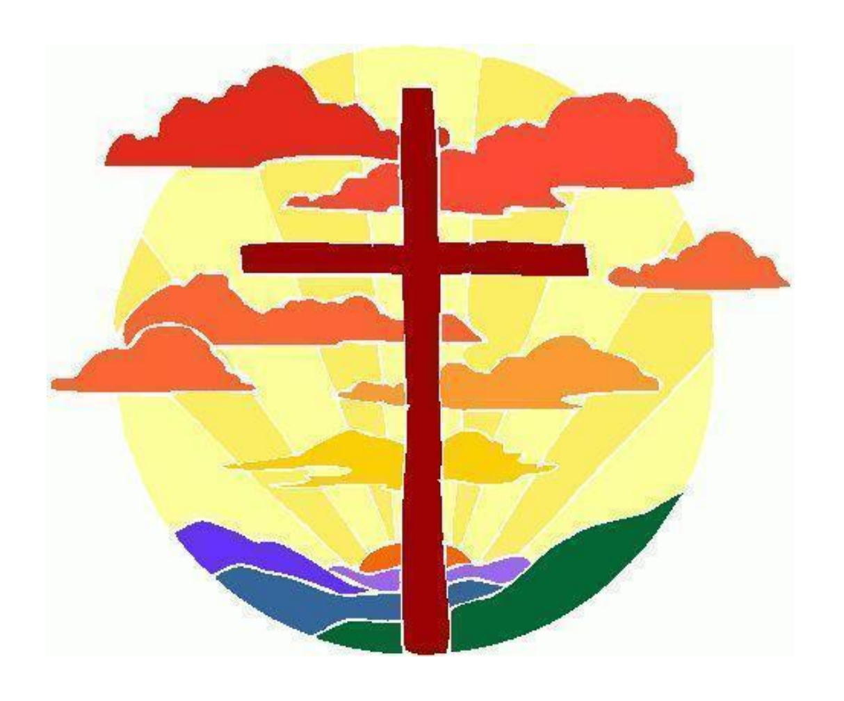
The Fifth Sunday of Easter The Holy Eucharist: Rite II April 28th, 2024