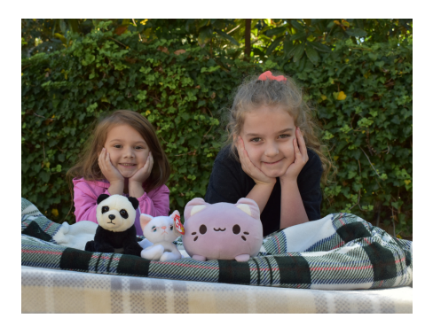
To favorite stuffed animals...