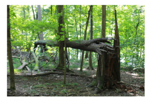
Don't let yourself forget that God's grace rewards not only those who never slip, but those who bend and fall.