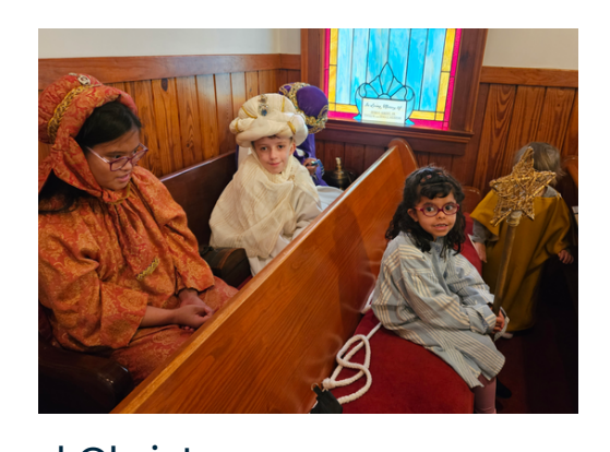
Annual Christmas Pageant