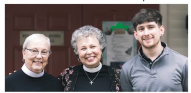
Advent at All Saints, with Coffee Bar Fellowship