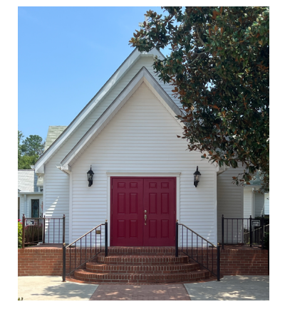
Annual Meeting and First Potluck of the New Year

Do join us as we recap 2023 and share some of the possibilities of 2024, as we gather for food and fellowship in the Parish Hall, right after worship.