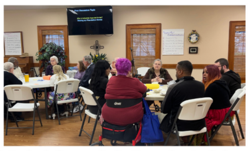
Gathering in Community: Real Issues Speaker Series, Talking about Inclusivity